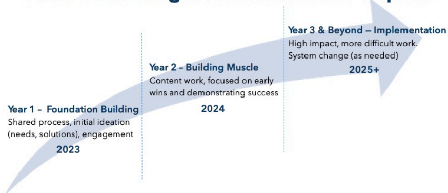
Figure C1. A framework for building a foundation for impact from year 1 was presented during Meeting 2, highlighting the importance of building a shared process and ensuring member engagement from the start.

A significant portion of the meeting was devoted to discussing the drought risk management cycle (Fig. C2). This cycle encompasses a standard disaster crisis cycle, segmented into four key quadrants: Mitigation, preparation, and capacity building; Forecasting and monitoring; [Emergency] response; and Recovery [from disaster]. Each category encompasses a broad range of activities, such as enhancing storage capacity and refining scientific understanding during the mitigation phase.