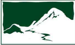
SIERRA NEVADA ALLIANCE